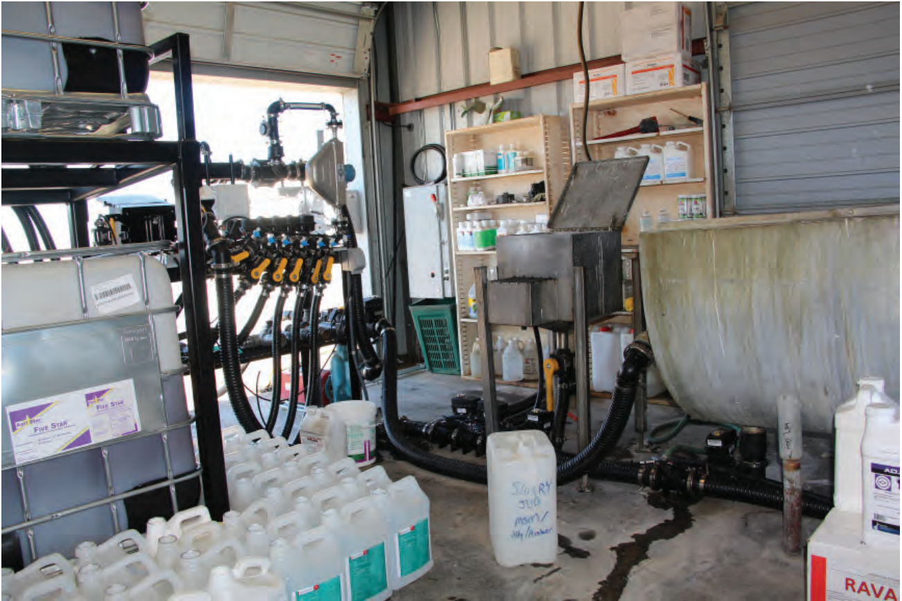
Incorporated existing manual inductor and mix vat. Electric valves connected to custom switch box at operator's station select product used and flow direction.