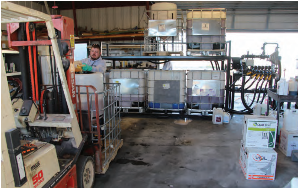
Cone tanks mounted in cage pallets for pouring-up jug product to be metered in bulk by QuickDraw.